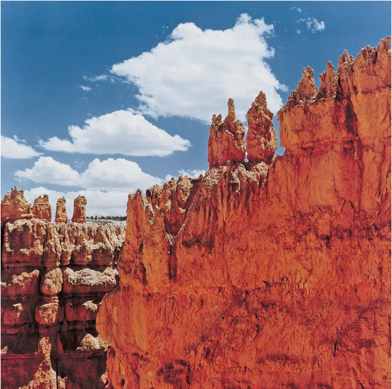
Bryce Canyon, Utah

Copyright © 2012 Massachusetts Medical Society.